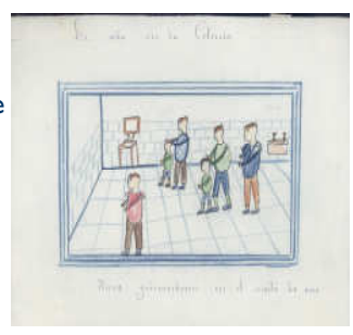
Boys in Colony

One of the topics that their teachers frequently assigned was scenes of life in the colonies. Far from the front, the government-sponsored group homes offered comfort and security after the trauma of bombardment and death.